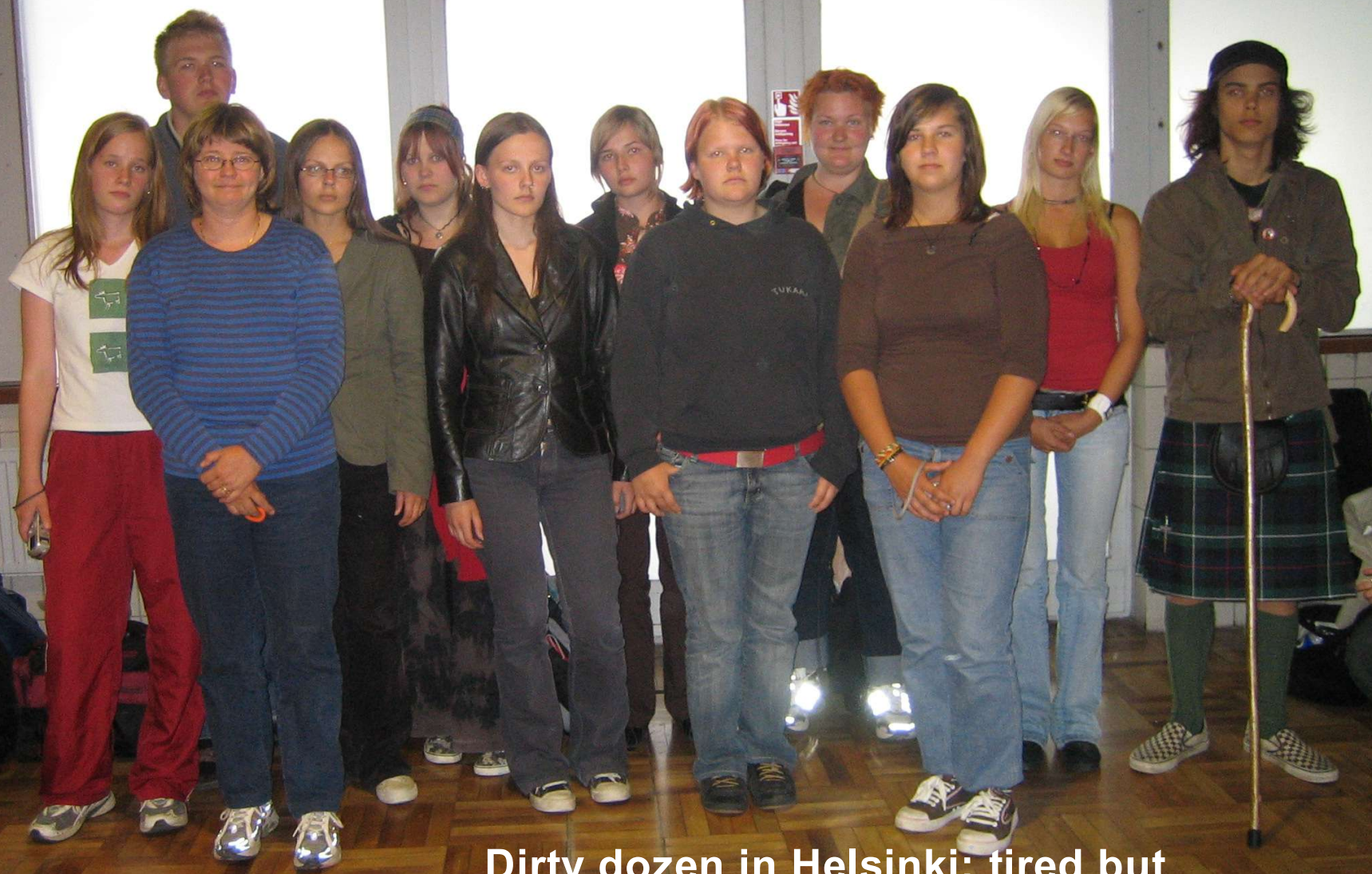
Dirty dozen in Helsinki: tired but happy!!!!